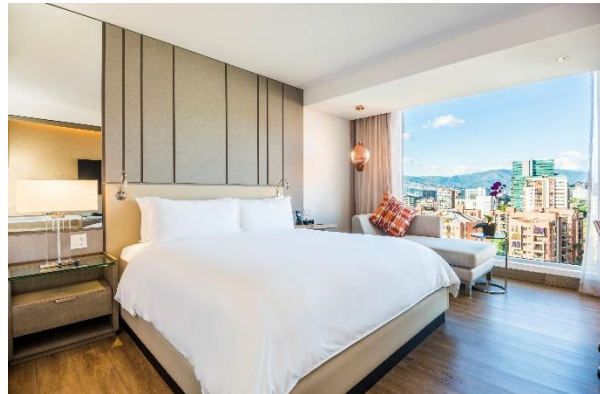
Medellin Marriott Hotel