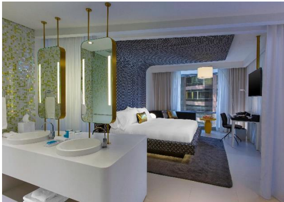
W Hotel Bogotá