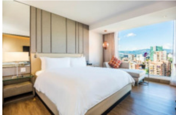
Medellin Marriott Hotel