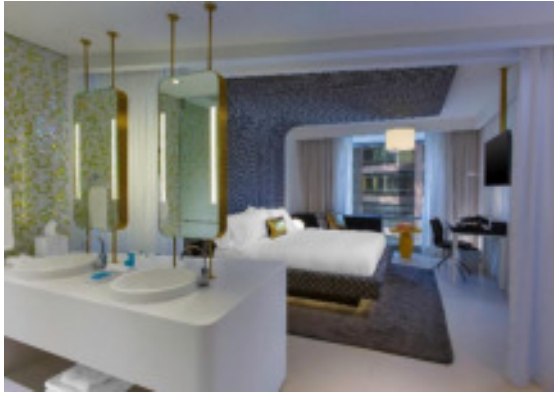
W Hotel Bogotá