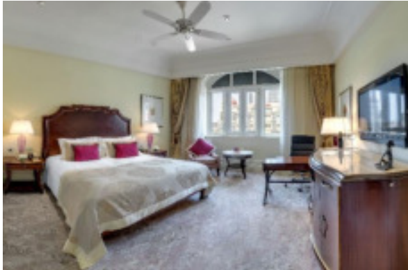
Taj Mahal Palace – Mumbai ★★★★★