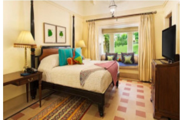
The Oberoi Udaivilas – Udaipur ★★★★★