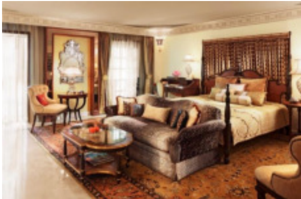
Rambagh Palace – Jaipur ★★★★★