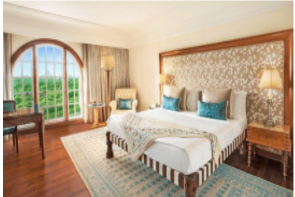
The Oberoi Amar Vilas – Agra ★★★★★