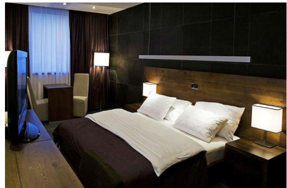
AVALA RESORT AND SPA-BUDVA