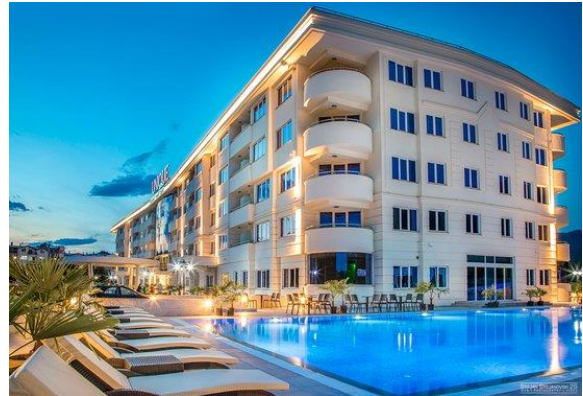
UNIQUE RESORT & SPA – OHRID