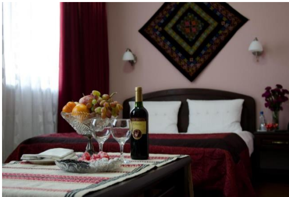
Jipek Joli Hotel, Nukus ★★★★★