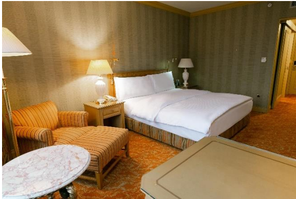
Hotel Inter-Continental, Almaty ★★★★★