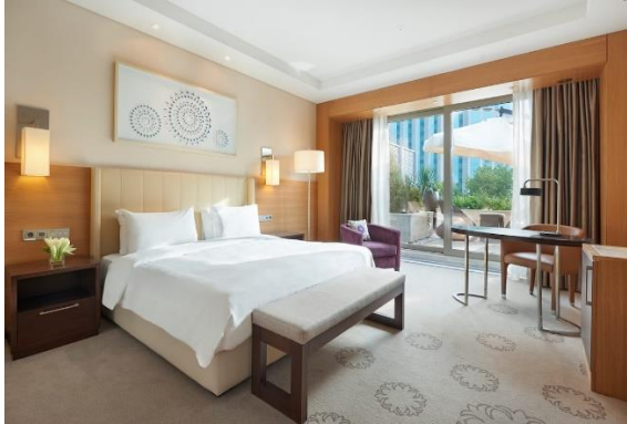
Hotel Hyatt Regency, Tashkent ★★★★★