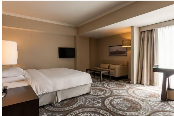
Hyatt Regency, Bishkek ★★★★★