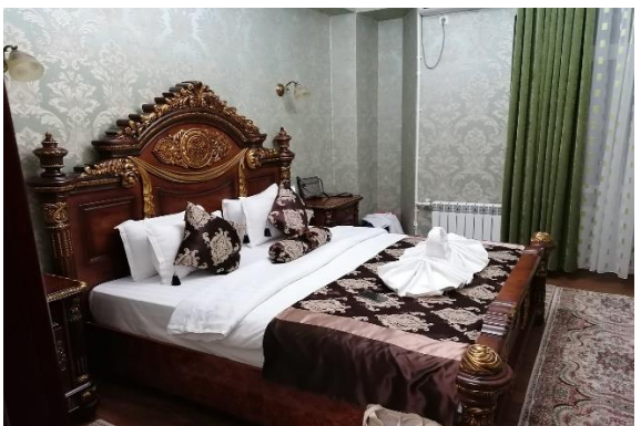
Hotel Khujand De Lux ★★★★★