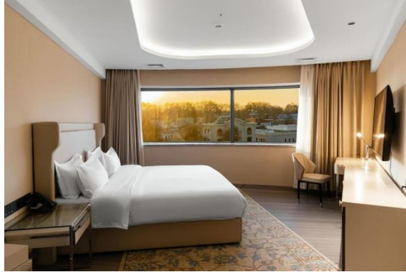
Movenpick Samarkand ★★★★★