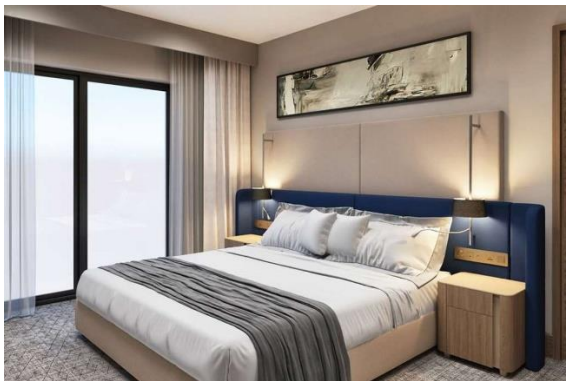
Hotel Wyndham Bukhara ★★★★★