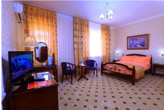
Hotel Asia Khiva ★★★★★