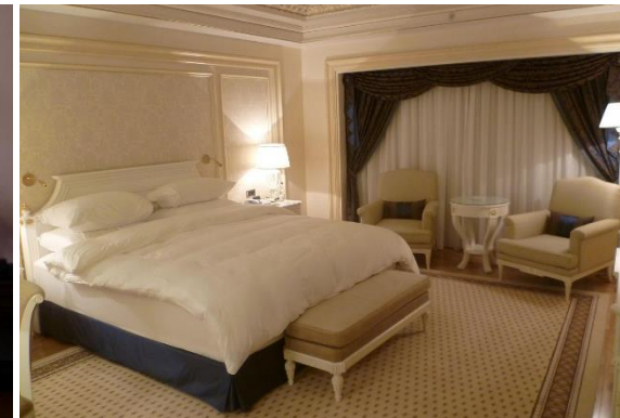
Oguzkent Hotel ★★★★★