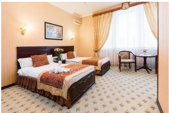
Asia Fergana ★★★★★