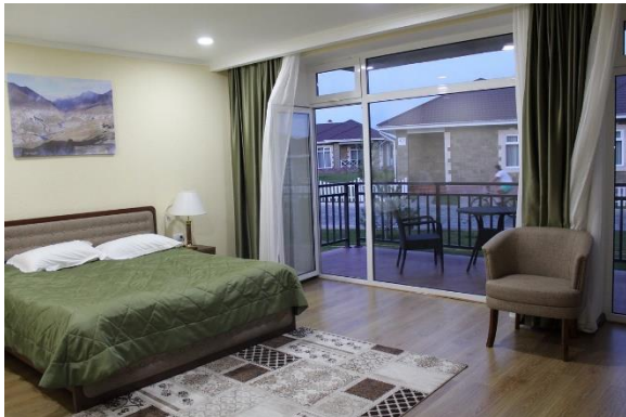
Karven Four Seasons Resort, Issyk-kul ★★★★★