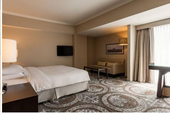
Hyatt Regency, Bishkek ★★★★★