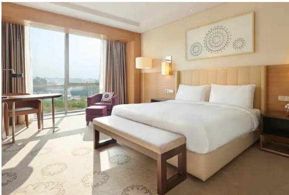
Hotel Hyatt Regency, Tashkent ★★★★★