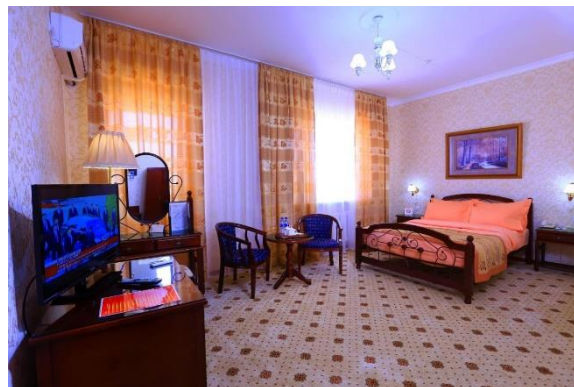
Hotel Asia Khiva ★★★★★