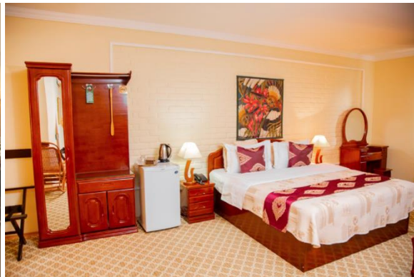
Grand Samarkand Superior ★★★★★