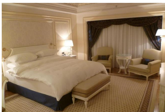
Oguzkent Hotel ★★★★★