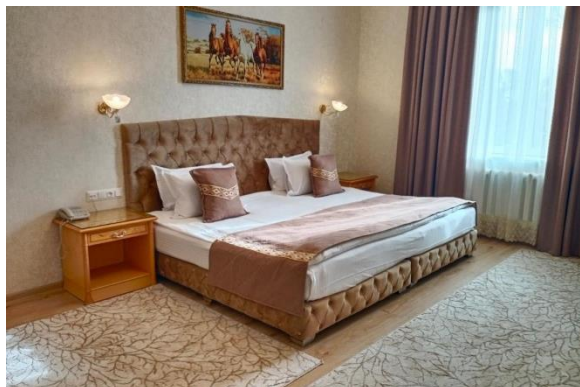
Hotel Asia Bukhara ★★★★★