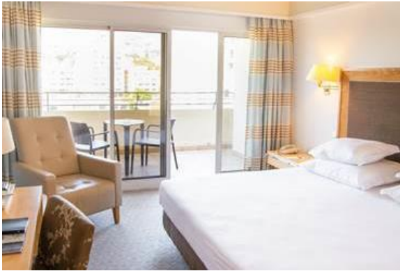
Pestana Carlton Funchal , Funchal ★★★★★