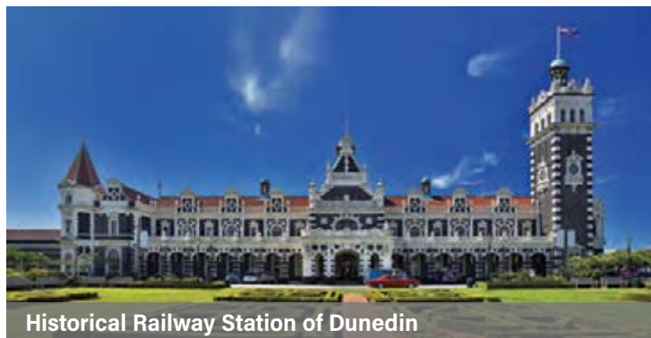
Historical Railway Station of Dunedin