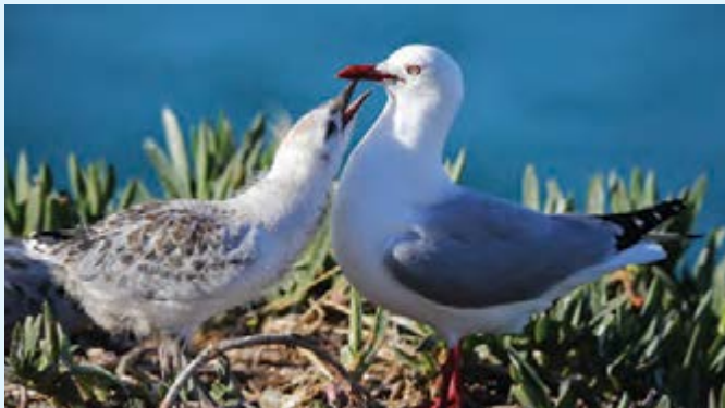
Red-billed gulls, Stewart Island