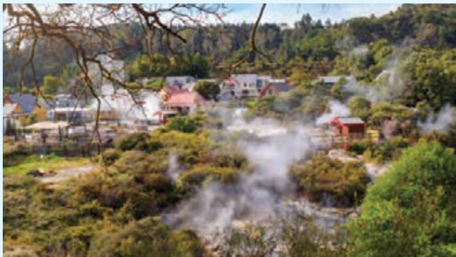
Thermal Village of Whakarewarewa, Rotorua